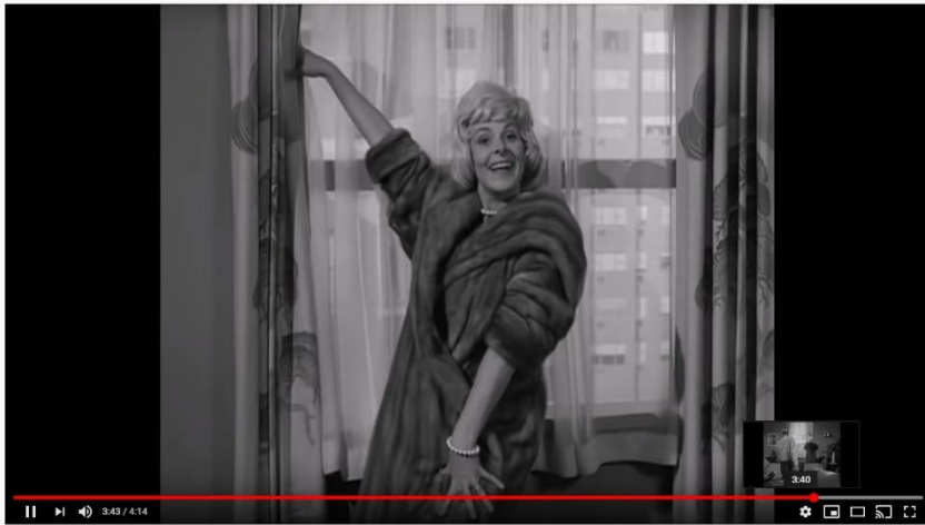
The Twilight Zone - A Most Unusual Camera (clip)